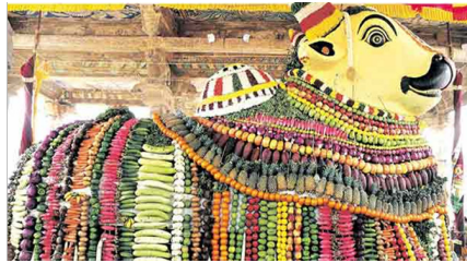
Fig 6. Nandi adorned with vegetables and fruits (After Malaimalar dated January 17, 2019)

On the day of Maatu Pongal in mid-January (Pongal festival celebrated exclusively for cattle), the Nandi is adorned with one thousand kilos of fruits and vegetables (Fig.6). Pradosha day every month is celebrated with abhisheka for Nandi in a grand manner.