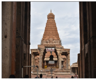
Fig 1. The temple Vimana *

The temple has two main gateways-gopuras built during the Chola period. On entering the temple, a huge Nandi mandapa is seen that houses a huge Nandi. However, the Nandi mandapa and the Nandi were built during the time of the Nayaks. According to some scholars the original Nandi built during the Chola time due to its smaller size is kept in the prakara mandapa near Varahi temple (Balasubramaniyan, 1995). As the Linga is huge, the later Nayak rulers could have replaced the smaller Chola period Nandi with a bigger one as Brihadeswara (Lord Shiva who is magnificent) deserves a huge Nandi.