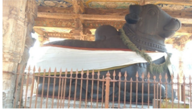
Fig. 5. Nandi in Nandi mandapa (Nayak Period)

Nandi is decorated with manireka on his forehead, and he is adorned with a garland of bells around his neck and body. Apart from this, three layers of neckbands adorn the Nandi. He is shown seated in a couchant position with the head held high. His eyes and ears are prominently portrayed. He has a saddle cloth over which a band runs. He has a very prominent hump but the folds of the hump as seen in Chola Nandi are not visible. His dewlap merges with his frontal portions. His tongue is shown outside. His horns are sharp and huge.