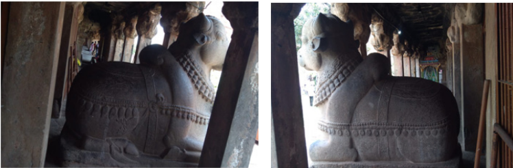
Fig.3 and 4. Profile of Chola Nandi

He is shown with a hump that is shown prominently running across his body like a thick fold. This feature is unique which is not seen in the later period. This feature is noticed in pre-Rajaraja Nandi sculptures with hump shown around the body with folds (Fig 3 and 4). This can be dated to the Chola period stylistically based on similar Nandi forms found at Puspavaneavara temple, Tiruppunturutti (Near Thanjavur), Sadyayar Kovil, and Isvara Kovil, Pudur (Dhaky, 1972).