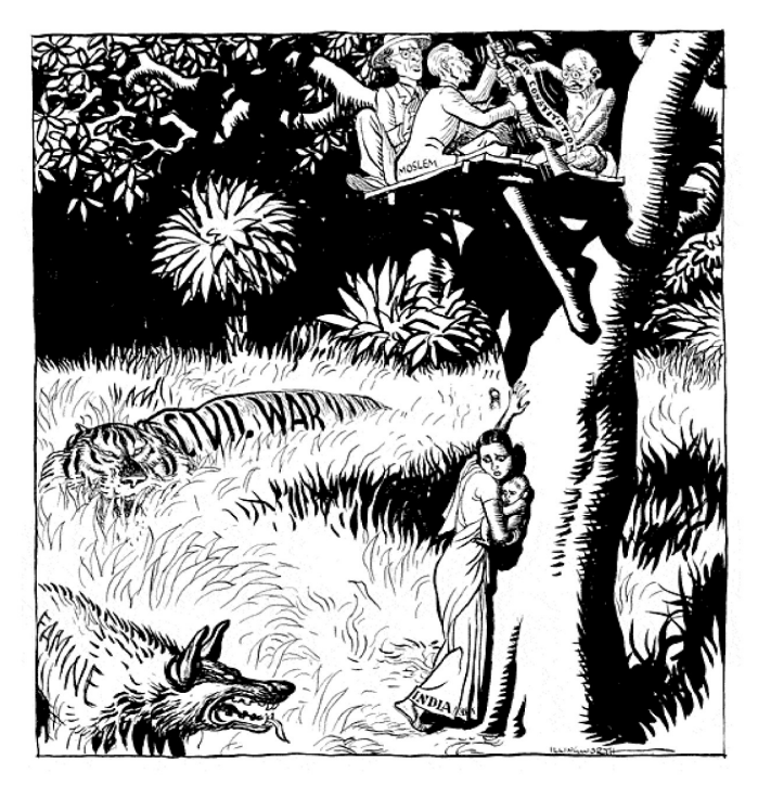
Figure.2 (Daily Mail 14 May 1946)

The problems in India were fast getting out of hand for the British and therefore the government sent a Cabinet Mission to reach a settlement between the parties involved about the future of the sub-continent (B. Metcalf and T. Metcalf, 2001:215). The Viceroy in fact was not very favorable to this idea as he did not believe that a few weeks of discussion would help in settling the scores (Wavell and Moon, 1973:206). In spite of the second Simla conference, the two major parties in India, the Congress and the League did not find themselves getting any closer. In fact they had grown further apart from each other, though both parties were quick to explain that they had gone to great lengths but the other party would not budge and thereby causing the failure of the talks(Wavell and Moon, 1973:267). On the 14th of May, was published a cartoon under the title, Civil War and famine threaten India , depicting the tug-off for power between the Indian leaders (figure.2).