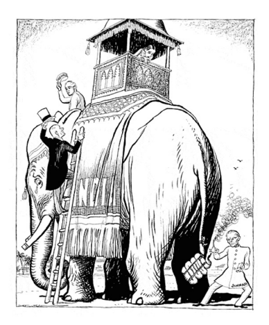
Figure.3 ( Daily Mail, 2 September 1946;)

the then Viceroy, waving off Nehru as he prepares for the ride on the elephant titled India (Figure.3).A woman, apparently representing the people is sitting in the cabin behind him and her frightened gaze takes our attention to what Jinnah is doing. He is lighting explosives tied to the tail of the elephant in an attempt at endangering the riders atop the elephant. The implication being that through efforts like direct action, Jinnah and his party were trying to sabotage the new government in office.