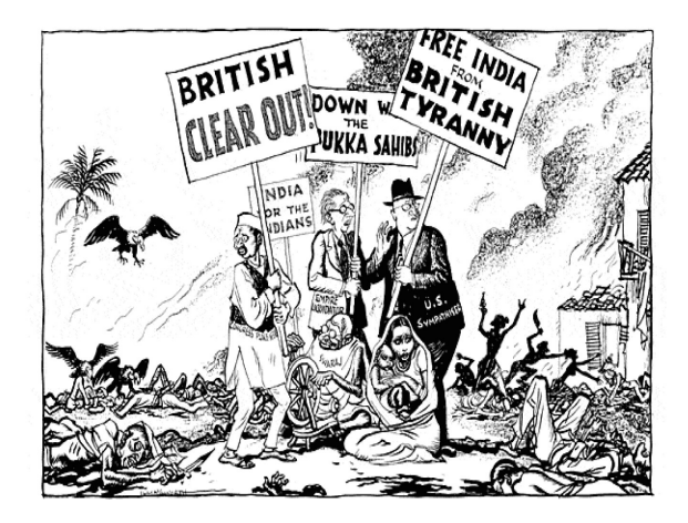
Figure.5 (Daily Mail, 20 May 1947; Courtesy: www.cartoons.ac.uk)

cartoon (Figure.4). It shows an open cage out of which a ferocious tiger – Civil War- emerges. Nehru, representing Congress, is depicted as opening the cage and out of cowardice lying atop it. Lying there at a safe distance, Nehru asks the British to leave India, and claims that they can do without them. The cartoonist is thereby taking a dig at the Congress leadership, accusing them of being at least partly responsible for letting violence and civil war happen and their inability to face it and put an end to it. A soldier representing the British however places himself valiantly between the beast and the vulnerable lady (Indian people) who is carrying a baby this time shown with another kid – who is again, a girl. The question raised by the caption therefore could be elaborated into - what could the Indian leaders do without the help of courageous and able British officers?