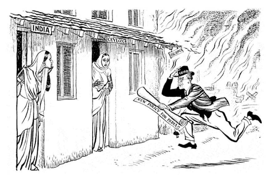
Figure.1 (Daily Mail, 13 March 1942)

Situations in South Asia and the closing in of war on India had started troubling the British by this time and they badly needed the support of Indian public as well as the leaders, which the latter were not willing to give. The fact that their support was taken for granted and the way they were treated at the end of the First World War, in spite of their giving full support in that case, were the reasons. It was in this light that Cripps persuaded the British War Cabinet to a draft declaration that promised India Dominion Status once the war ended (Sarkar, 1983:385-386). The cartoon therefore has Cripps running in hard to a building which is ablaze (persumably the British Empire) of which a good part i.e. up to Burma is already burnt down. The next in the line of a fast spreading fire is Ceylon and then India. These two are drawn as ladies visibly frightened and apparently awaiting a saviour. The plan that Cripps is coming with however, is exclusively for India; alluding thereby that when compared to Ceylon, it is India, that the British can ill afford to let go and that the same is whom they need on their side.