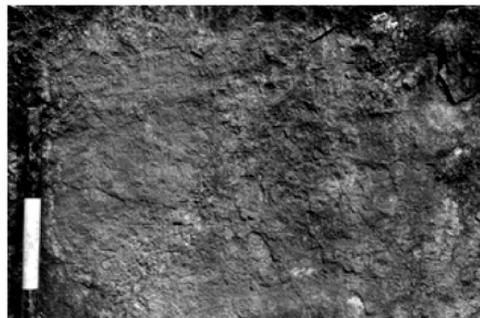
Pl.4. The inscription of Sri Rajendra Chola-I