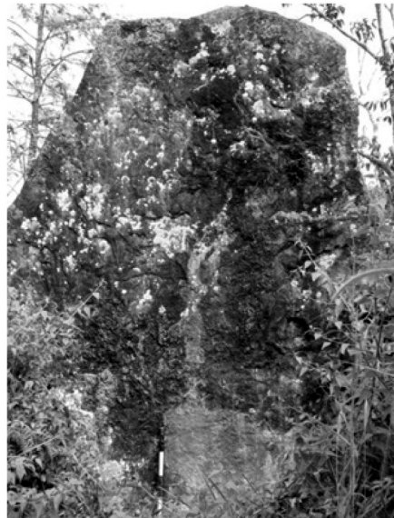
Pl.2. Inscription on the eastern face