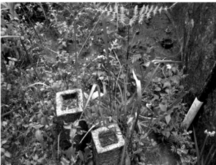
Pl.3. stone lamps and a bell placed near the menhir.