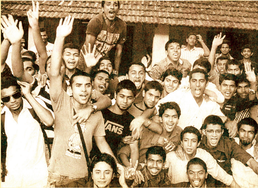
Jubilant College Fine Arts Team.