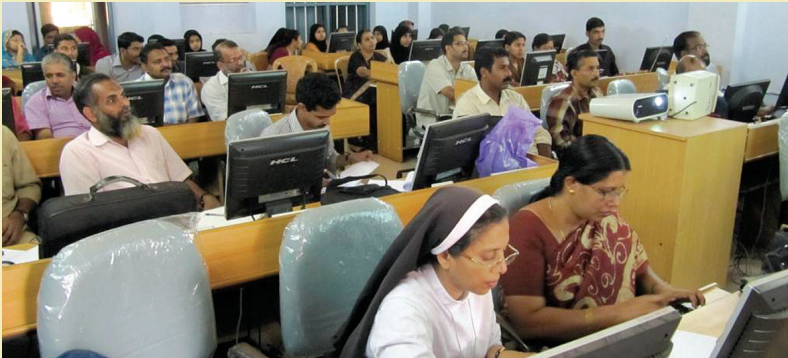
Workshop on Python.