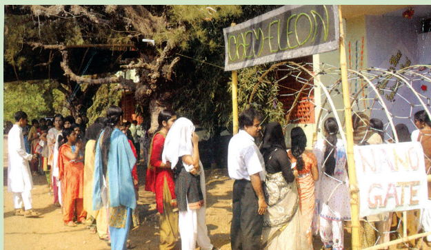
CHEM-ELEON'11: A queue in front of the NANO GATE