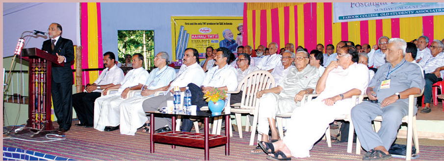
Justice A.K. Basheer, High Court of Kerala inaugurates Fostalgia Diamond Plus.