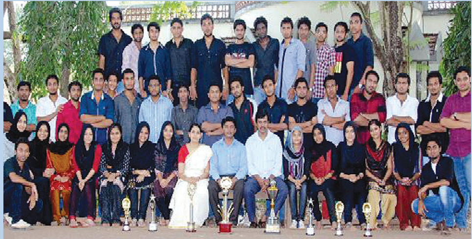
Overall champion of LUMINANCE Management Meet.