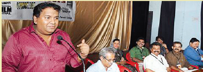
Film maker Mr. Rajesh Pillai inaugurates the International Film Festival, Mapping the Contours.