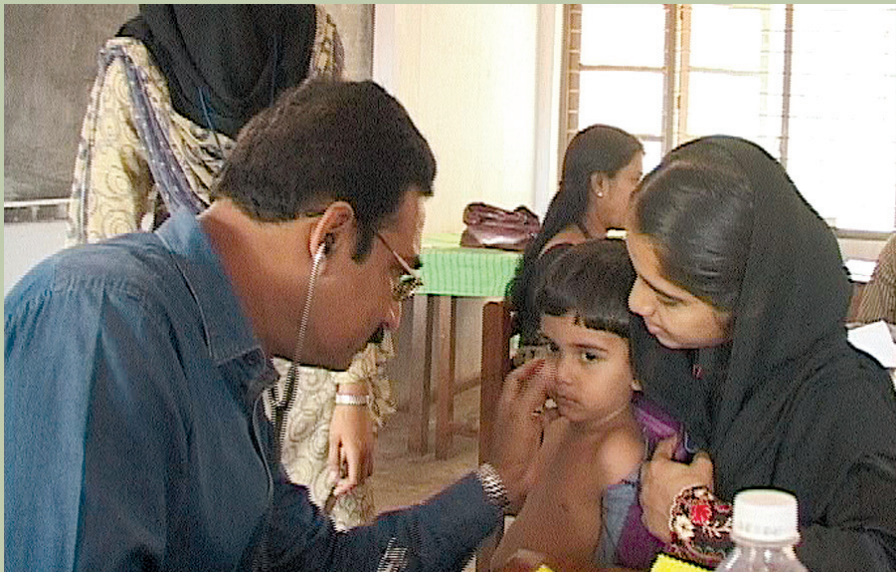
A scene from the Medical Camp.

As part of the Diamond Jubilee Celebrations, the Health centre organised a Medical Camp in association with the Lions Club, Calicut, and IMA, Feroke on 27th February 2011. Eminent doctors from different branches of modern medicine led the camp. More than 500 persons from neighbouring villages and around 400 students utilized the camp. Free medicines have been distributed. An eye testing camp at Al Farook Residential School was organized on 3rd August 2011 with the technical support of Al Salama Hospital, Kozhikode.