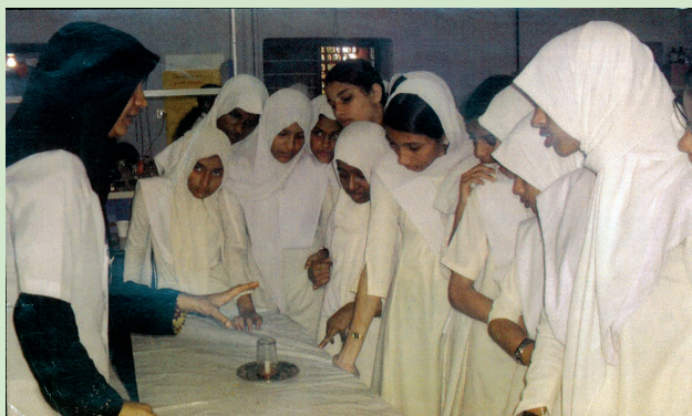
A Student of Chemistry Department enlightens the school students at the CHEM-ELEON'11.

In connection with the Diamond Jubilee Celebrations of the college and as a part of the celebrations of International year of Chemistry, the Department of Chemistry in collaboration with the Association organised CHEM-ELEON'11, an exhibition on Chemistry from 19th to 21st January 2011. The objective of the exhibition was to enlighten, inspire and promote a scientific temperament among the students of neighbouring educational institutions as well as the students on the campus with the motto "Chemistry Our Life, Our Future".