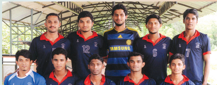
Calicut University handball champions.