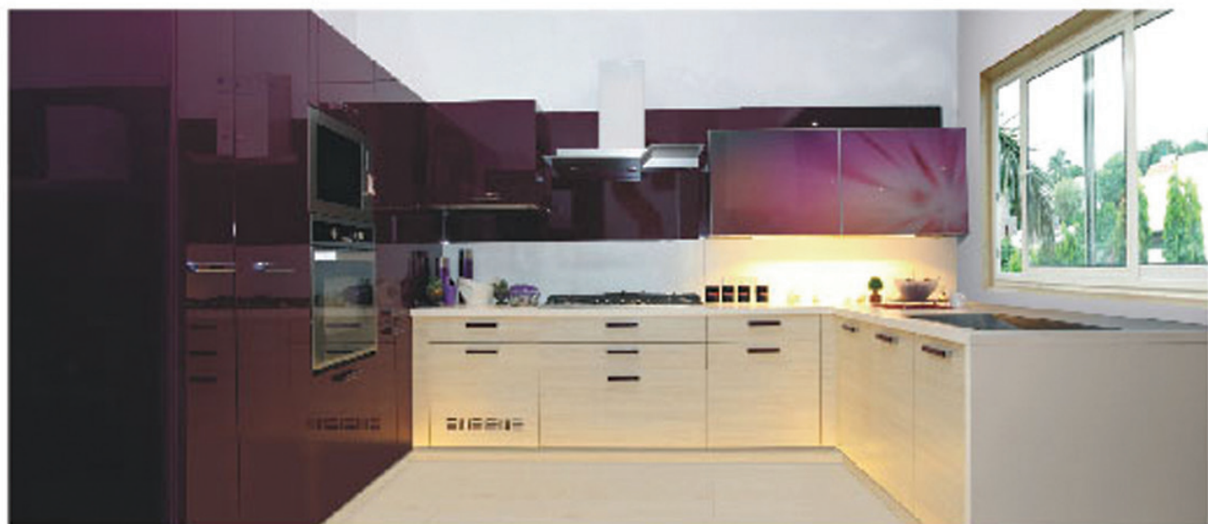
Master Chef Sanjeev Kapoor

Everything Under One Roof Kitchen, Accessories, Appliances & Hardware