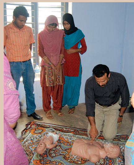
Basic Life Support Training to students by expert from Malabar Institute of Medical Sciences (MIMS).