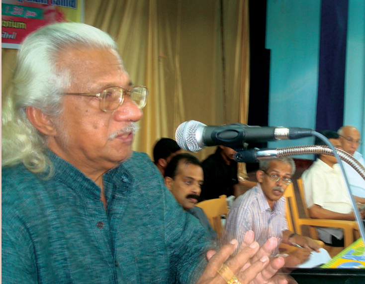
Film Director Mr. Adoor Gopalakrishnan interacts with students.

A s part of the Diamond Jubilee Celebrations of the college, a Three Day Film Festival on the theme of Childhood was organized by the department on 13-15, October 2010.