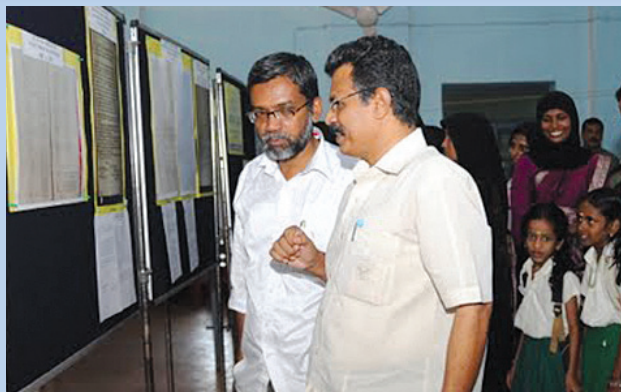
Colonial Malabar Exhibition of Archival Sources on British Malabar.

The Department launched the UGC-CPE Project, Writing Microhistory – Methodology and Practice , as part of the Three Day Workshop conducted on 29-31 March 2011. Dr. T. Muhammedali presented a paper on Arab Writings as Sources of South Indian History at the National Seminar organised by the Department of Arabic & Islamic