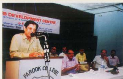
Mr. E. Ahamed, Minister for External Affairs, inaugurating the Web Development Centre.

Our commitment to the cause of environment was reflected in the tree planting drive organised in August 2004. This campaign for a green campus was aimed at conscientising the students and the general public about the importance of growing new trees while preserving the old.