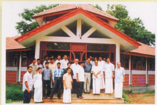
→ The College Cafeteria supported by FOSA, Dubai Unit commissioned on 3 July 2004. Mr. P.K. Kunhalikutty, Minister for Industries, Mr. P.V. Abdul Wahab M.P., Office Bearers of FOSA and Managing Committee Members of the College are seen.