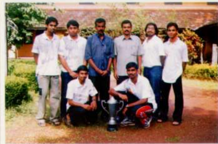
College Shuttle Badminton Team - Winners of Interzone for the sixth year in succession

Our talented sports stars brought home several laurels excelling in different games. Last year we emerged right on the top with an overall performance considered to be one of the best in the recent history of Farook College. Never before have six teams of Farook College figured in the Calicut University Inter-zone Finals. We proved our mettle at the Calicut University Inter-zone Championship with the Shuttle Badminton securing for the sixth year in succession, The Table Tennis (Men) team securing for the second consecutive year and for the first time in the history of Farook College and the Table Tennis (Women) team winning the Inter-zone Championship. Our volleyball, handball and softball teams emerged runners up in the Calicut University Inter-zone Championship.