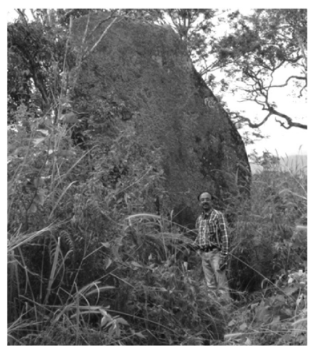
Pl.1.The mehir amdist thick vegetation

This inscription newly deciphered is important on two accounts. Till today, the entire array of reported Chola inscriptions has remained exclusive to the ancient south Travancore region, now comprising the Kanyakumari district in Tamil Nadu. In earlier reported Chola inscriptions, there are references to the coastal towns of Vizhinjam, Kollam,