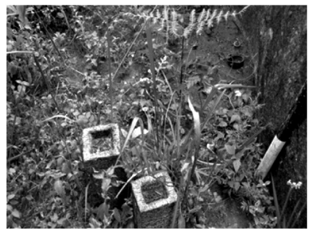
Pl.3. stone lamps and a bell placed near the menhir.