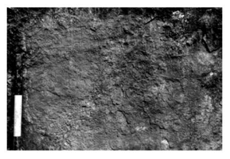
Pl.4.The inscription of Sri Rajendra Chola-I