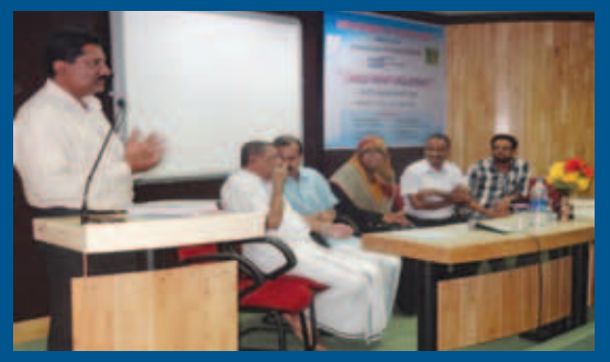
Exposing the Reality: R. L. Byju, Sub Judge, Kozhikode moderating the Panel Discussion conducted by Department of Sociology

arranged to make the inmates happy. Students prepared and served food for the inmates. The department organized a visit to the tribal area of Attappady on 25 September 2014 to examine and analyse the socio economic living condition of the tribes. They also conducted a survey related to the tribal issues. The students conducted Food Supply Programme by supplying lunch for the street children of Calicut district on 9th June 2014. The students prepared food from their own homes and supplied it to the