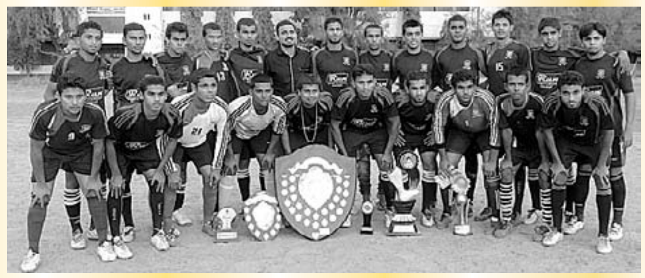
Kozhikode District 'A Division Foot Ball 'league champions