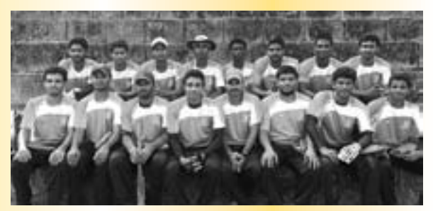
Base Ball (Calicut University Interzone Champions)