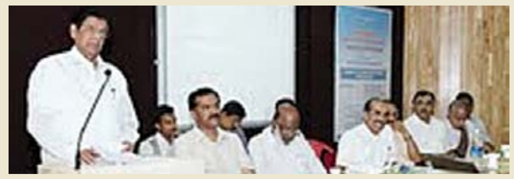
Mr. E. Ahamed, Minister of State for External Affairs & HRD, inaugurating the National Seminar on 'Maintenance of Quality in Higher Education: Prospects and Problems'.

he National Seminar on Maintenance of Quality in Higher Education: Prospects and Problems was inaugurated by Mr. E. Ahamed, Hon'ble Minister of State for Human Resources Development and External Affairs, on 8th & 9th March 2012. He presented a brief report on the proposed programmes by the human resource department focusing on the development of education especially that of minorities. He opined "The basic challenge of the Indian educational system is the inefficiency to compete with the International educational system". He brought out the fact