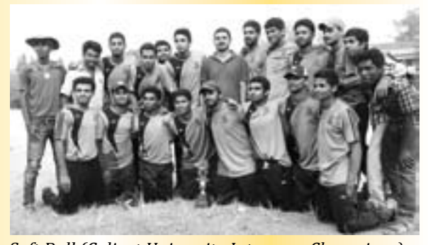
Soft Ball (Calicut University Interzone Champions)