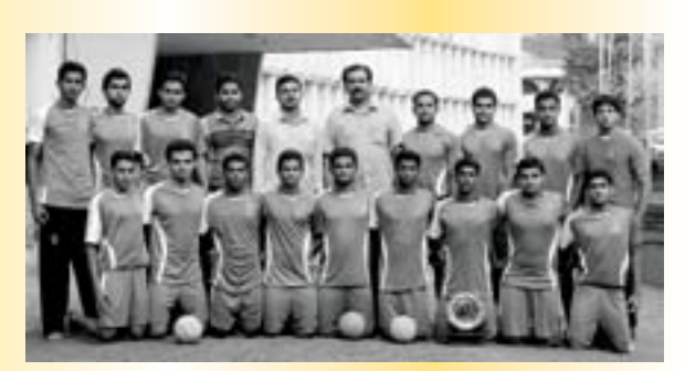
Hand Ball (Calicut University Interzone Champions)