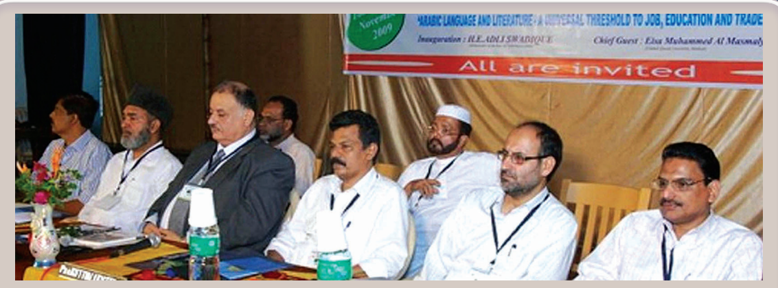
Two- Day National Seminar on Arabic Language & Literature- A Universal Threshold to Job, Education and Trade inaugurated by H. E Adli Swadique, The Ambassador of Palestine.