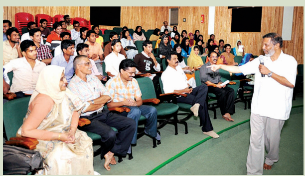
One Day Workshop on Communication Skills entitled Lingua Compendium.