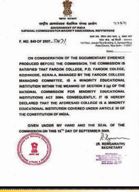
Recognized as a 'Minority Institution' by the National Commission for the Minority Institutions, Govt. of India.