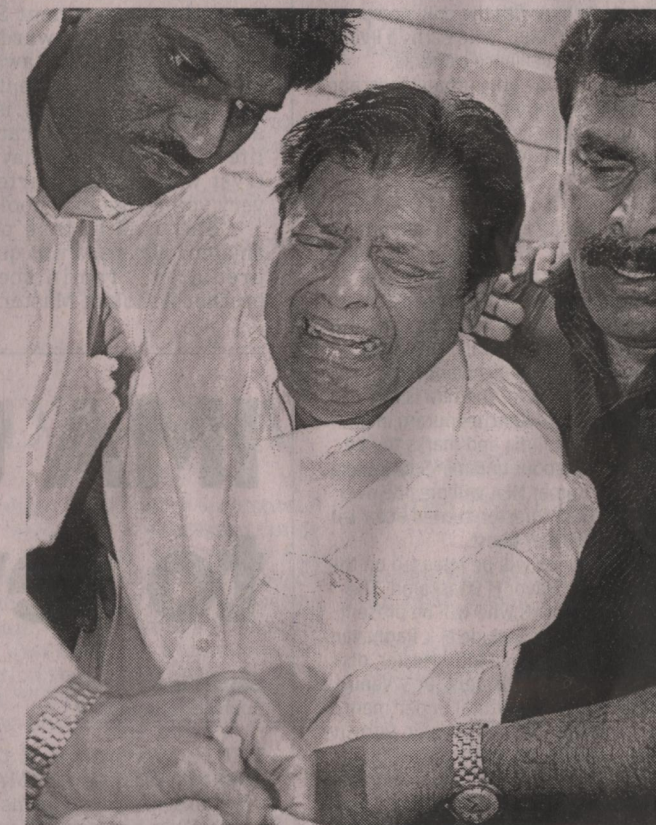
Union Minister E Ahmed breaking down on seeing the body of Mohammedali Shihab Thangal at Panakkad on Sunday.

Large number of police had been deployed at many places in the district headquarters to control the crowd of mourners. Traffic had been disrupted at many places following the arrival of vehicles from various parts of the state.